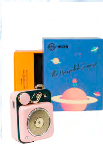
Muzen Button Speaker