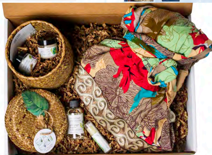
Box with Women's Options