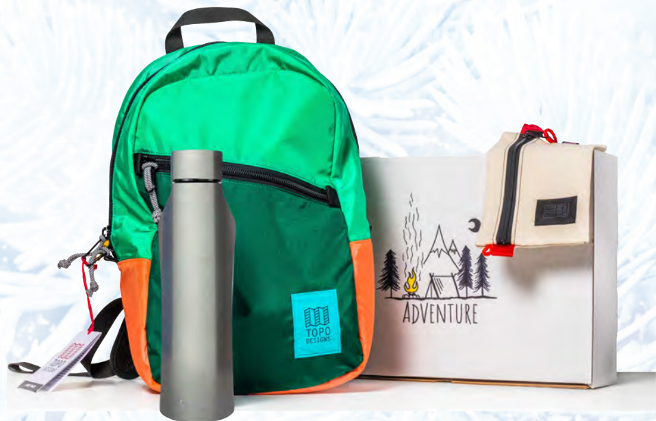
Box with LightPack Backpack