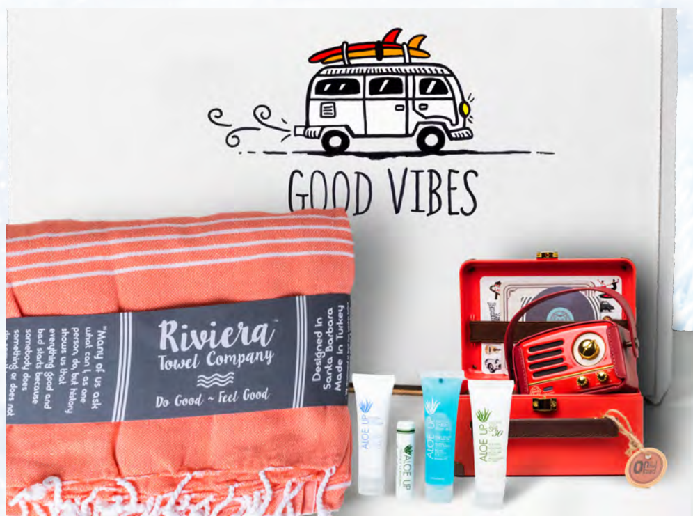
Box with Muzen OTR Speaker