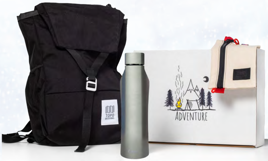
Box with YPack Backpack