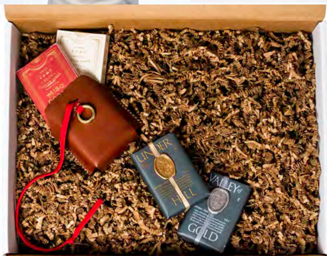
Box with Men's Options